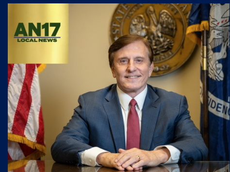
AN17 LOCAL NEWS