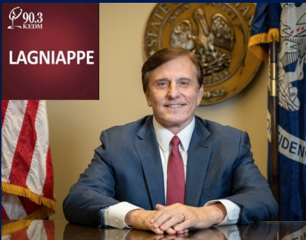
90.3 KEDM RADIO